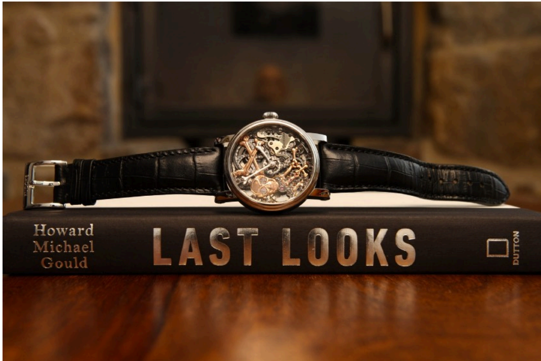
Real Skeleton and the book Last Looks

So that's how our KUDOKE "Real Skeleton" ended up making its way to Atlanta USA in the summer of 2019, where the film was shot against a Hollywood backdrop. Of course, in advance we had to sign documents that agreed strict secrecy of the project. So we had a watch in a film and were not allowed to talk about it. That was tough!