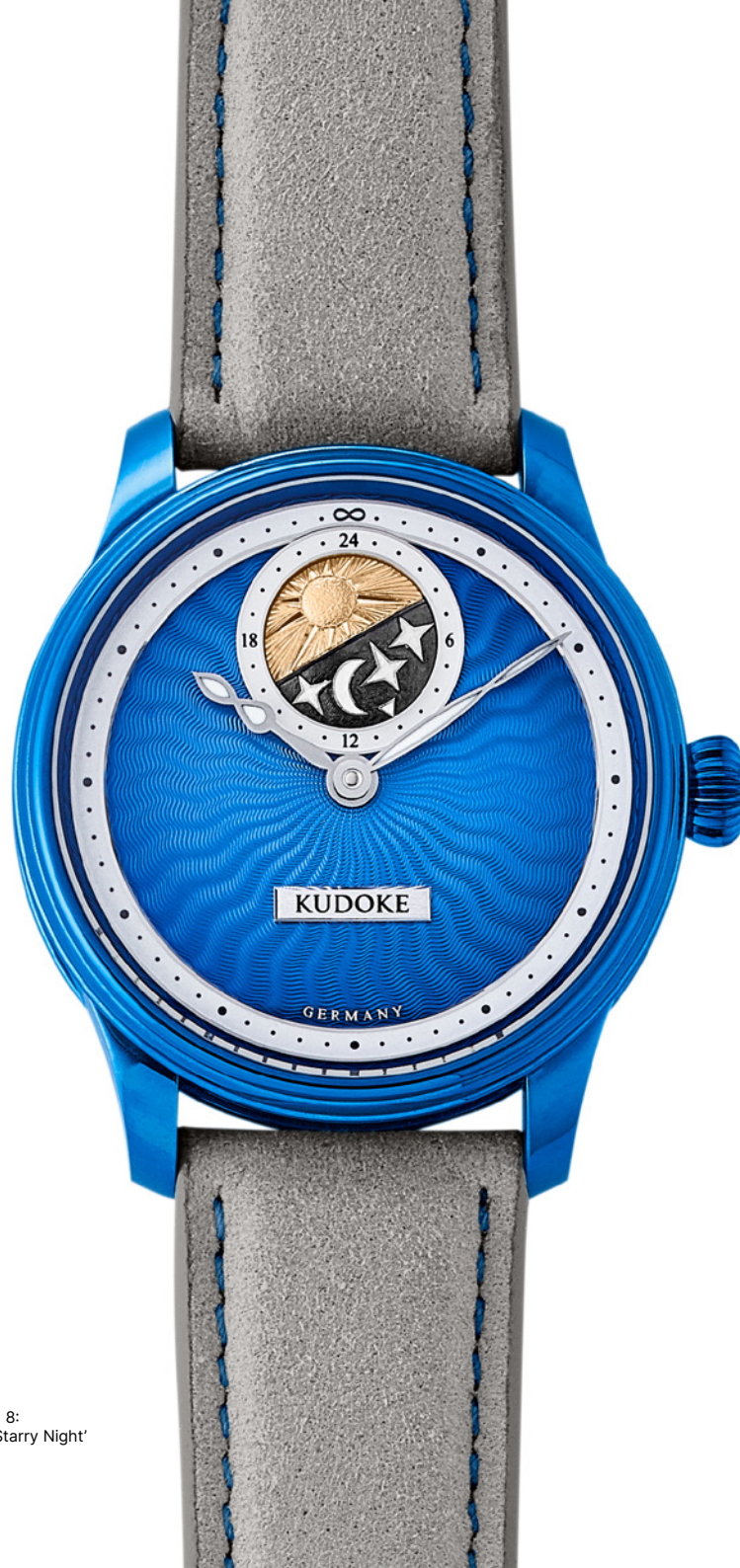
Grail Watch 8: Kudoke 2 'Starry Night'

It gives me great pleasure to announce the latest Grail Watch collaboration project with independent watchmaker Stefan Kudoke. The watch we have decided to work on is his Geneva Grand Prix award-winning Kudoke 2, a 39mm by 10.7mm watch featuring Stefan's in-house Kaliber 1-24H. This movement represents an important act of democratization for stunning handmade finishing. It includes a hand-frosted movement bridge, mirror-polished angles, a hand-engraved balance cock, snail-finished barrels, all in a far more accessibly priced package than these crafts are normally associated with.