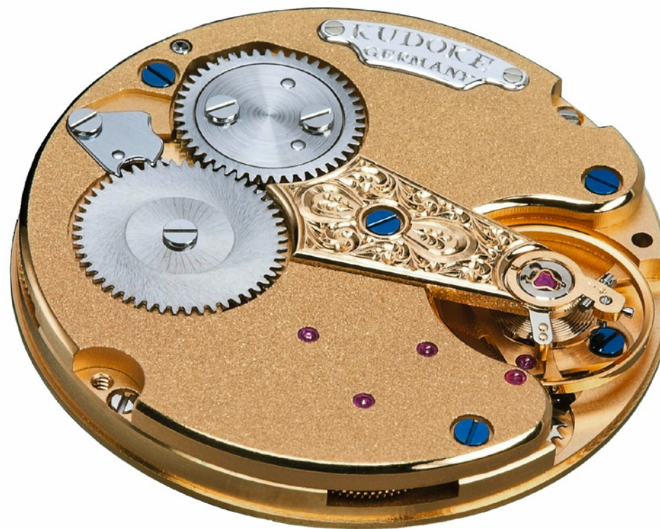
The stunning and original movement design of the Kudoke Kaliber 1-24H

The first thing you'll see when gazing at a Kudoke caliber is a stunning and original movement design. It is configured in a three-quarter plate design that is typical of Saxon watchmaking but has a balance bridge that protrudes out almost directly from the movement's barrel and ratchet wheel, and creates the optical illusion that this bridge is integrated into the baseplate. I've always thought the architecture of this bridge, and the way it visually explodes from the barrel, brings a strong sense of dynamic energy to the movement design.