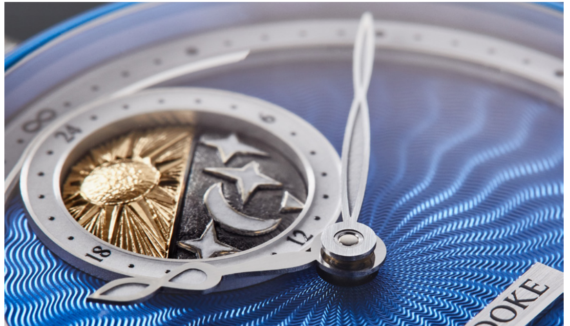
Up close with Grail Watch 8: Kudoke 2 'Starry Night'