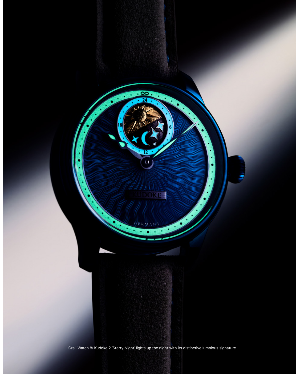
Grail Watch 8: Kudoke 2 'Starry Night' lights up the night with its distinctive luminescent signature

Finally, the infinity-shaped hands, the chapter ring for the indexes as well as the chapter ring for the 24 hours, and the hand-engraved sun and moon disk have all received the careful application of hand-painted Super-LumiNova to create a visual homage to the emotional impact of Van Gogh's legendary painting.